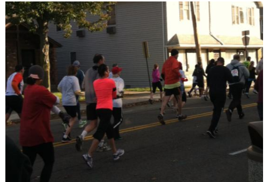
Runners at the start of Lincoln Park 5K

to have something to look forward to, as the Fall Classic has become the highlight of the year for many in town. Lincoln Park had a wonderful turn out of about 200 committed runners and walkers, despite the adversity residents were facing.