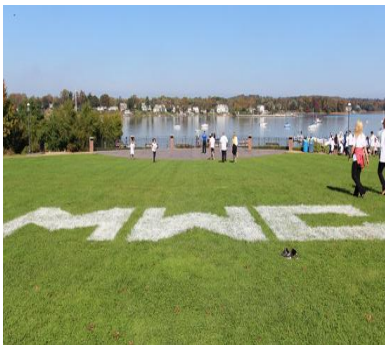
MWC in the park